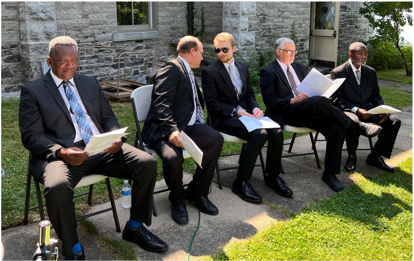
Five to Life Gospel Quintet