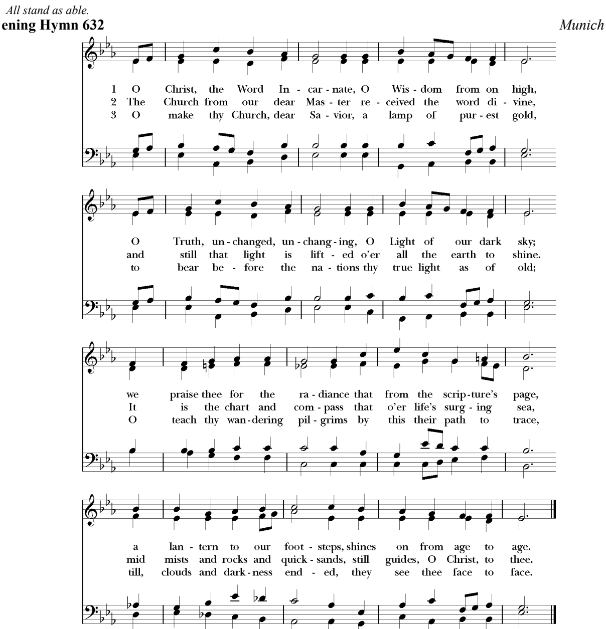
The Opening Acclamation

Bishop Blessed be God: Father, Son, and Holy Spirit. People And blessed be God's kingdom, now and forever. Amen.