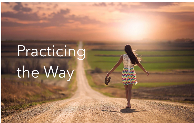
Practicing the Way

Following Jesus is more than going to church or believing the right things; it is practicing a way of life. This four-session introduction to spiritual formation is the perfect way for young women and girls ages 14-24 to kick off the summer. These sessions explore how to follow Jesus in our busy, distracted, and increasingly secular culture. This group will transform into a community that takes time to be with Jesus, become like him, and to do what he did. The program will begin with a reflection on each participants' spiritual health. The goal is for participants to leave the experience with a deep sense of community and an established Rule of Life. Sessions will be held on Wednesday evenings from 5:00 p.m.- 6:00 p.m. from June 19 - July 17; the group will not meet on the evening of July 3rd. To sign up for this course, contact St. James' Parish Office at 315.675.7600.