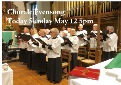
Chorale Evensong Today Sunday May 12 5pm