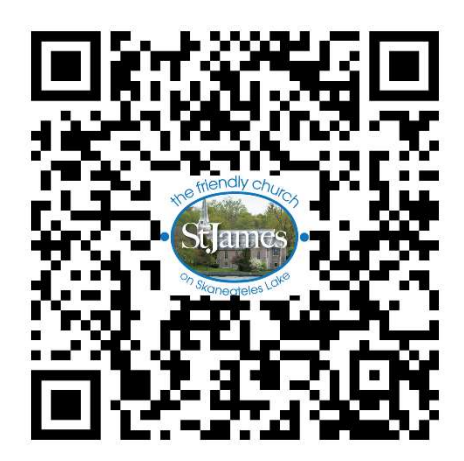
Scan this QR code to give online!

Hymn texts and music reprinted with permission under ONE LICENSE #A-735321. All rights reserved