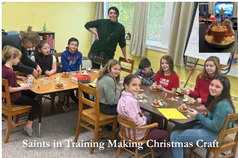
Saints in Training Making Christmas Craft